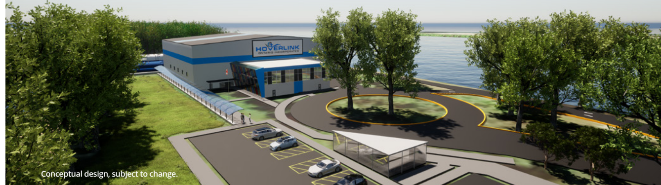
Conceptual design, subject to change.

We have key approvals in place to begin business operations in 2023. Our passenger service will include options to bring your bike/kayak/stroller, along with electric shuttle buses to get you to where you need to go.